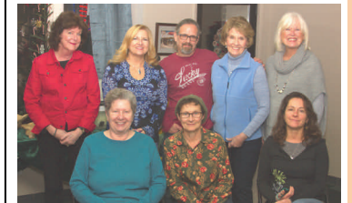
Your GACA Board of Directors