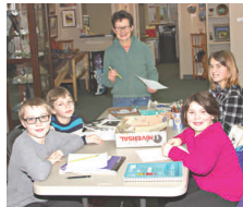
After school art class