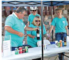
Volunteers manning the beverage table at the HMF