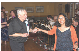
Dancing the night away at the “Swing & Sweets Big Band Dance”