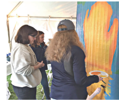
Students painting a mural @ the Alpenfest®

Gaylord Area Council for the Arts 125 E. Main St. ~ Gaylord, MI ~ 49735 989-732-3242 ~ gaylordarts@gaylordarts.org www.gaylordarts.org