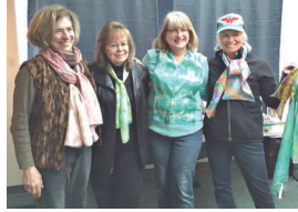
Participants in the Shibori prints workshop.