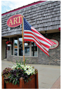
GACA’s Downtown Art Center