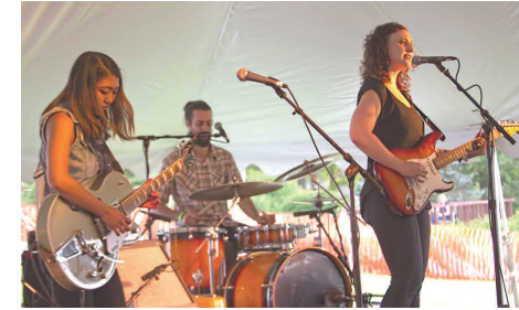
The Crane Wives @ the Headwaters Music Festival