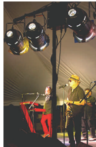
Mitch Ryder & the Detroit Wheels headlined the HMF