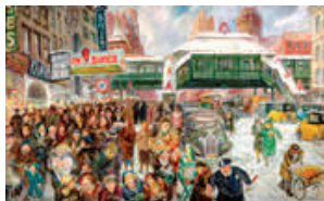
8. Fourteenth St. at Sixth Ave. by John Sloan. Location: Gaylord Public Restroom (corner of S. Court & First St.)