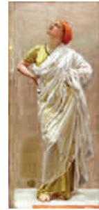
5. Study for "Birds" by Albert Moore. Location: Ah Loy Bamboo Restaurant (corner of N. Court and W. Main St., on the east wall )