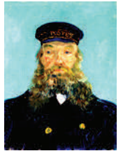
7. Postman Roulin by Vincent van Gogh. Location: Otsego County Courthouse (225 W. Main St., near the fountain)