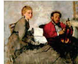
9. Violinist and Young Woman by Edgar Degas. Location: Huntington Bank (100 E. Main St.)