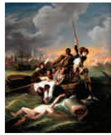
1. Watson and the Shark by John Singleton Copley. Location: Gaylord City Hall (305 E. Main St)