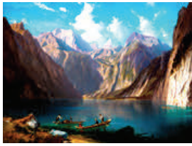
2. Konigsee by Willibald Wex. Location: Gaylord Area Council for the Arts (125 E. Main St)