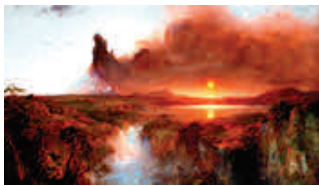
6. Cotopaxi by Frederic Edwin Church. Location: Gaylord Area Chamber of Commerce (319 W. Main St., on the west wall)