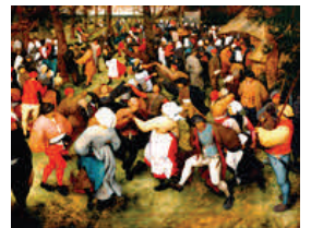
13. The Wedding Dance by Pieter Bruegel the Elder. Location: Otsego County Sportsplex (1250 Gornick Ave., on the building)