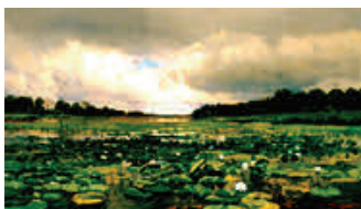
14. The Lily Pond by Charles Harry Eaton. Location: Aspen Trail (239 W. Commerce Blvd—corner of Commerce & Village St. On the main trail, near the first bench.)