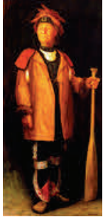
4. Chief Shoppenegons by Eanger Irving Couse. Location: Crave Restaurant (corner of N. Court and W. Main St., on the west wall)