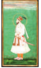
3. Portrait of a Mughal Prince by Unknown Artist. Location: Claude Shannon Park (126 W. Main St.)