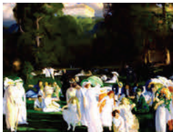
12. A Day in June by George Wesley Bellows. Location: Otsego County Sportsplex (1250 Gornick Ave., near tennis courts)